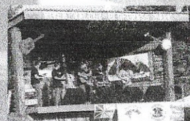
Host Band Hard Ryde